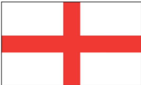
St George's Cross – England