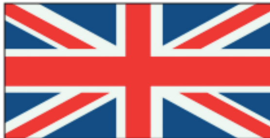
The Union Jack – United Kingdom (UK)