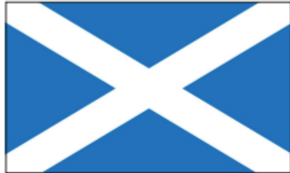
St Andrew's Cross – Scotland