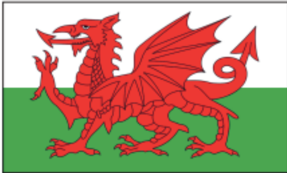
The Red Dragon – Wales