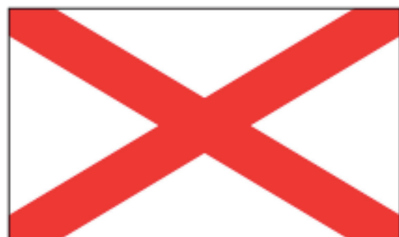
St Patrick's Cross – Northern Ireland